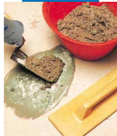
Floor patching: application of mortar