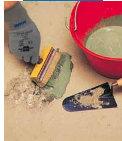
Floor patching: application of slurry