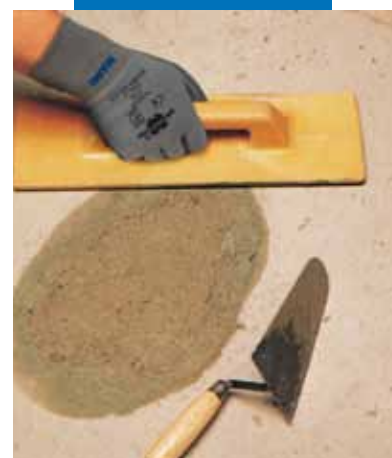
Floor patching: final smoothing