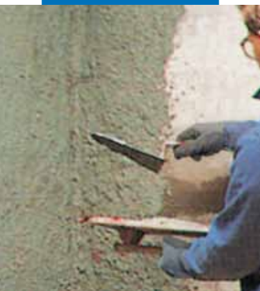
Adhesive render admixed with Planicrete