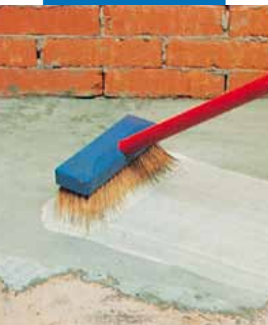
Application of cementitious grout with Planicrete admix