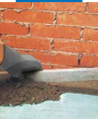
Application of cementitious screed with Planicrete admix