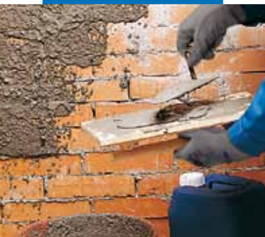
Base-keying mortar layer with Planicrete admix