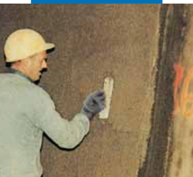
Cement plaster with Planicrete - Ville Marie motorway tunnel, Montreal, Canada