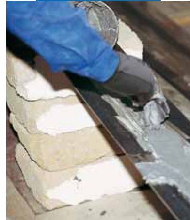
Application of Adesilex PG1 on metal sheet