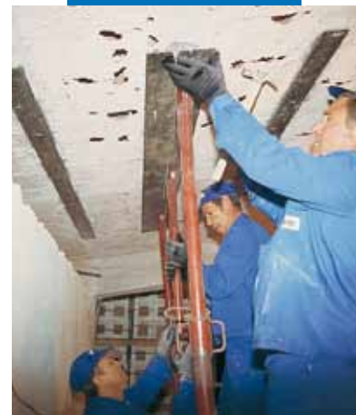
Placing metal sheet for structural reinforcement