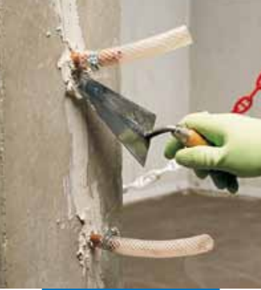
Fixing injection tubes and sealing cracks for structural consolidation

components A and B are also hazardous for aquatic life. Do not dispose of these products in the environment.