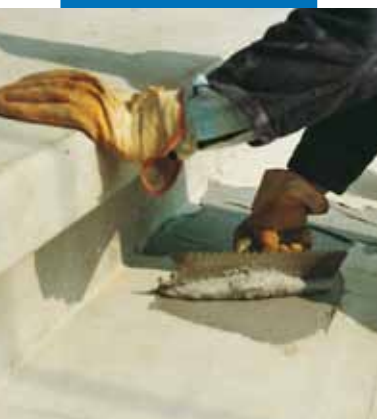
Application of Adesilex PG1 with a notched trowel for structural bonding of pre-fabricated steps