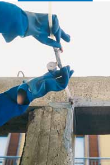
Column clad with Adesilex PG1